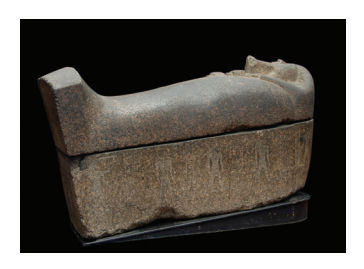
Other objectives of the day were to